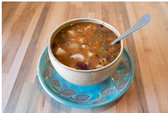
Soup's on at the Huggable Mug.

This taproom features some of the finest craft