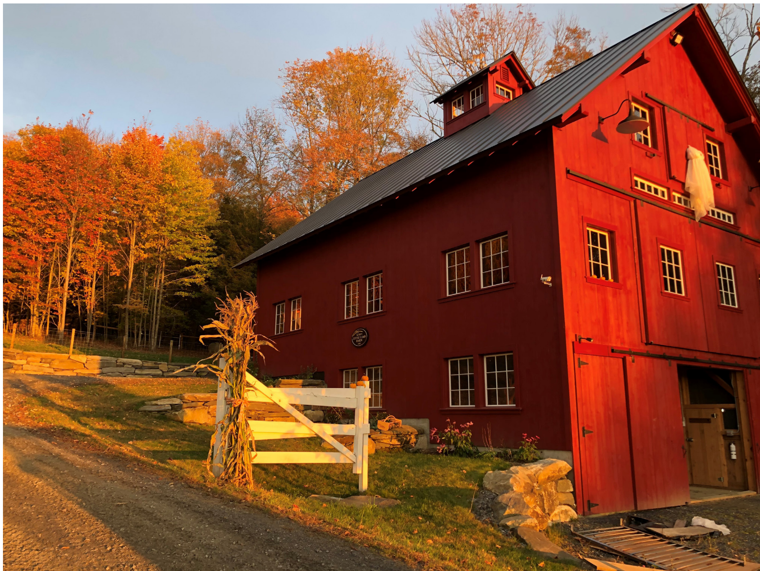
The barn at High Ridge Meadows Farm.